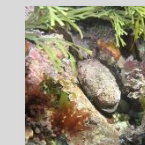
Te Tiaki Mahinga Kai