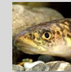
Fresh Water Fish