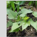
Te Whakatō Kūmara