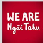
Mahinga Kai – Te Rūnanga o Ngāi Tahu