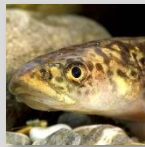
Fresh Water Fish