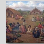
Kai Māori