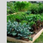
Te Whakatō Kai ki te Kura