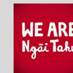
Mahinga Kai – Te Rūnanga o Ngāi Tahu