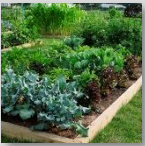
Te Whakatō Kai ki te Kura