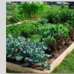
Te Whakatō Kai ki te Kura