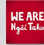
Mahinga Kai – Te Rūnanga o Ngāi Tahu