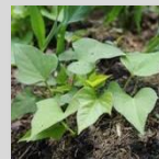
Te Whakatō Kūmara