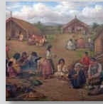
Kai Māori (Te Ara Encyclopedia of NZ)