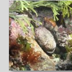
Te Tiaki Mahinga Kai