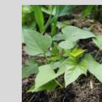
Te Whakatō Kūmara