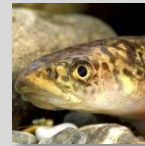
Fresh Water Fish