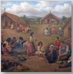
Kai Māori